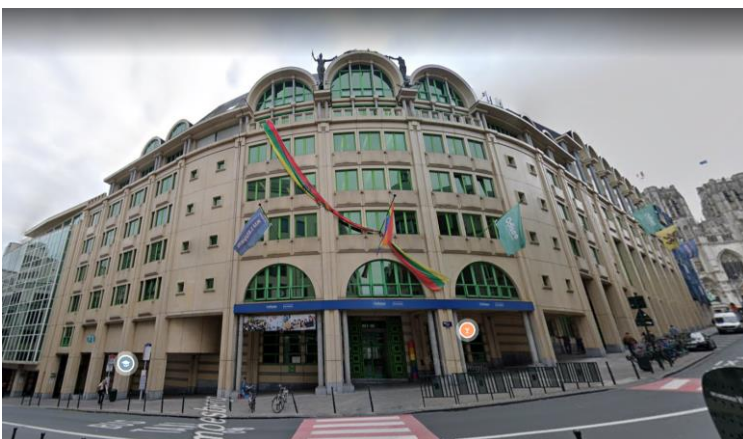
View on main entrance

Below you can find a picture of the Hermes building . Participants are advised to not enter via the main entrance, but to enter via the side entrance (about 50 m to the left of the main entrance). This side entrance is inconspicuously located between the entrance and exit to the underground parking garage of the building and opposite of the Radisson Collection hotel.