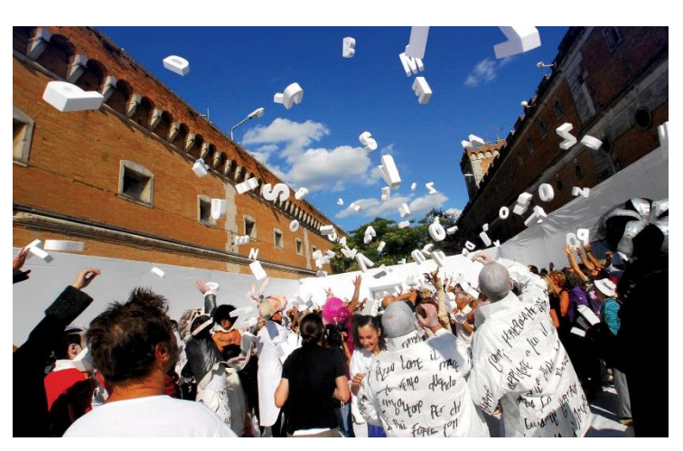
Theatre in prison