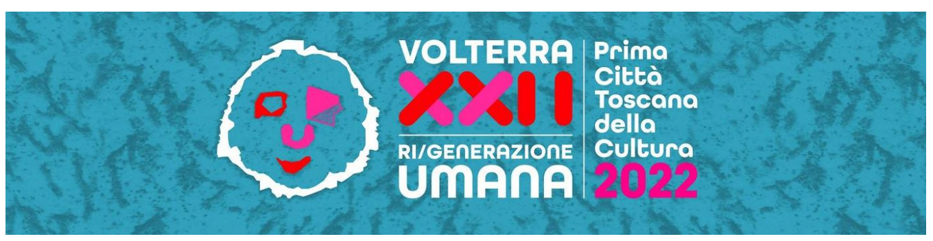
Logo of Volterra First Tuscany City of Culture

Through participation of stakeholders and citizens, UNCHARTED is investigating the impact of Volterra 22 on the territory and how the experience has been able to empower the value of the regional dimension of culture.