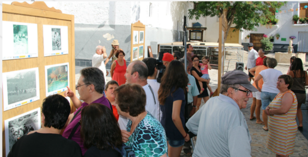
Photo Contest Exhibition