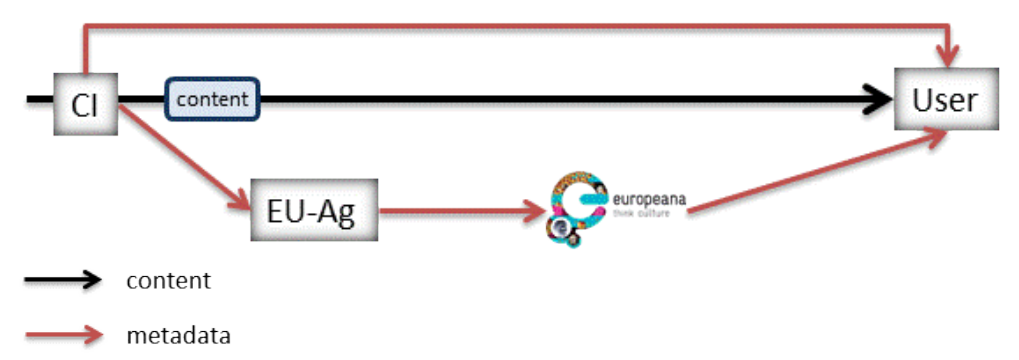
Figure 3 - Content and metadata value chains in the Europeana model

Europeana operates in this short value chain aggregating metadata<sup>68</sup>. So we have two value chains: one, extremely short, for content; the other, more complex, for metadata (see Figure 3):