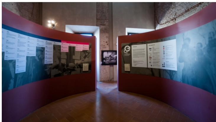
The timeline

The vernissage started at 6 pm with speeches by the local authorities, the project's coordinators and the representative of Europeana, the great European digital library, which the project is so much linked to. The cocktail party and opening visit of the exhibition then followed.