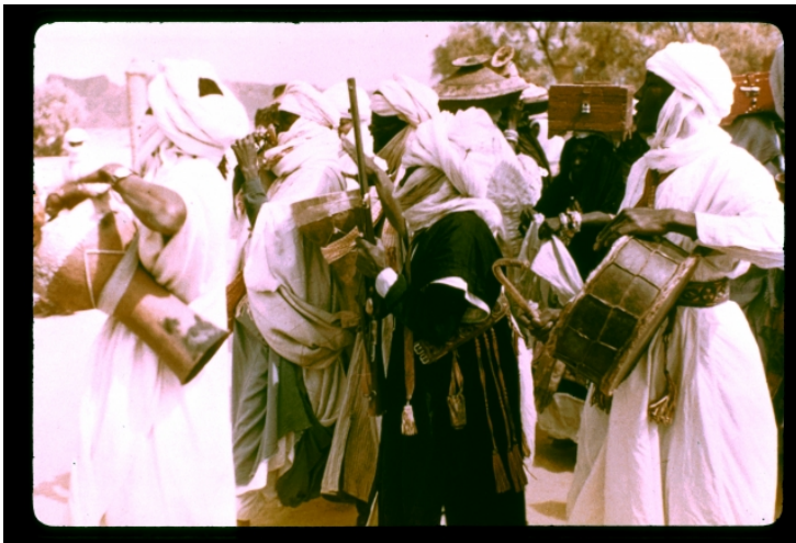
photo: Fonds Marceau Gast ? Ahaggar : Les musiciens, photographie de Marceau Gast, 1960 ? CC-BY-ND

MMSH sound archives centre also offers to browse violinmakers storytellings who show the technical gestures to build a violin, a cello, a bridge or a bow and how was the violinmakers life at the beginning of the 20th century until today.