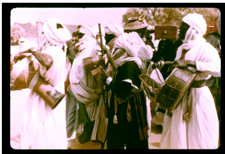
photo: Fonds Marceau Gast ? Ahaggar : Les musiciens, photographie de Marceau Gast, 1960 ? CC-BY-ND

MMSH sound archives centre also offers to browse violinmakers storytellings who show the technical gestures to build a violin, a cello, a bridge or a bow and how was the violinmakers life at the beginning of the 20th century until today.