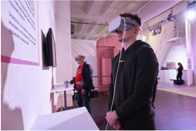
VR to see the reconstructed ancient castles