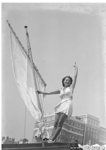
Holiday makers at Brighton 1937

The large fleet of cars at the quayside at Monte Carlo for the purpose of conveying tourists round the sights - February 1925 TopFoto is an independent picture library based 45 minutes south of London in Edenbridge, Kent, England. The archive contains 10 million images from medieval documents to today's digital files being sent in by FTP from all over the world. The core of the hardcopy archive comprises of 120.000 negatives from John Topham (an individual photographer and TopFoto's founder) plus millions of negatives and hardcopy prints from a variety of historic press agencies that have been collected by the current owner, Alan Smith, since 1975. TopFoto supplies primarily editorial content to clients but is extremely diverse and its pictures are reproduced in all areas of visual publication. TopFoto was a pioneer in digitisation and electronic transfer and through new technologies has formed close links to international partners in over 40 countries around the world.