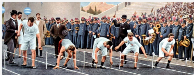
0812988.jpg The line up for the 100 metres, 1896 Athens Olympics, Greece.