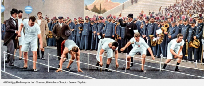
0812988.jpg The line up for the 100 metres, 1896 Athens Olympics, Greece.