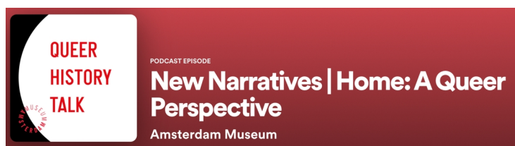
the screenshot of the podcast Queer History Talk

(1) The podcast Queer History Talk is hosted by the Amsterdam museum itself and updated periodically, it talks about current exhibitions and projects with various guests, interspersed with performances by artists from different disciplines. It also invites English speakers.