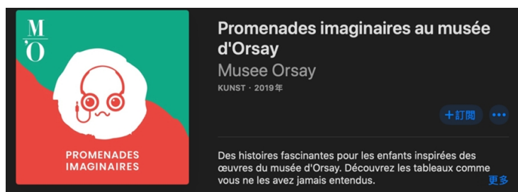
the screenshot of the podcast The Musée d'Orsay

(2) The Musée d'Orsay has launched its 'Promenades Imaginaires' podcasts, which release one season at a time. The author Béatrice Fontanel chose these paintings in the museum to imagine the stories visitors will hear.