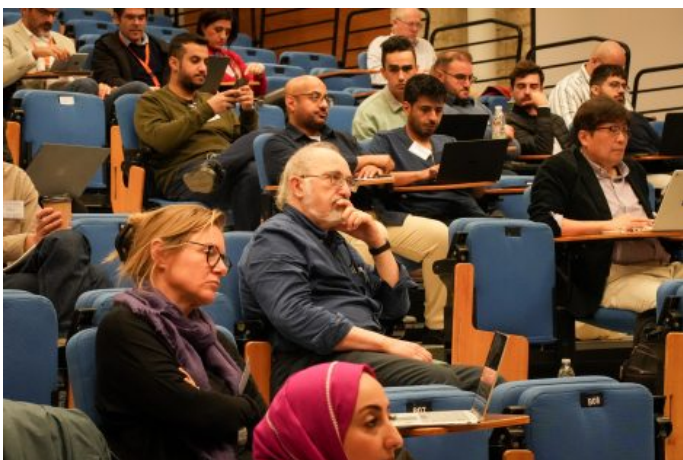
Audience at the opening