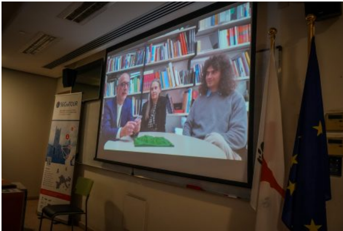
Video of the USI Team presenting the SECreTour pilot in Switzerland

Representatives of SECreTour, CULTURALITY. TOURAL sister projects and UNESCO Chair on Digital Cultural Heritage