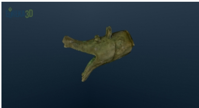
Bec verseur en forme de tête de sanglier (Inv. 2003.34.116.1)

Bibracte (Burgundy, France) was not only a place of consumption but also a manufacturing center with dozens of workshops producing a wide range of metal objects, including weaponry, currency, domestic utensils, and ornaments. Discover the 3D collection " The Oppidum of Bibracte (Burgundy, France), an Active Economic Center in the 1st Century BC. "