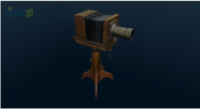
Voigtländer & John (objective)

Step into the world of history and heritage through stunning 3D collections that bring the past to life. From pre-cinema artifacts in Girona to everyday objects and cultural emblems from the ancient oppidum of Bibracte in Burgundy, these collections offer a unique window into the lives and creativity of our ancestors. Digitised and shared in the context of the EUreka3D project , these treasures showcase the value of preserving and exploring our shared cultural heritage.