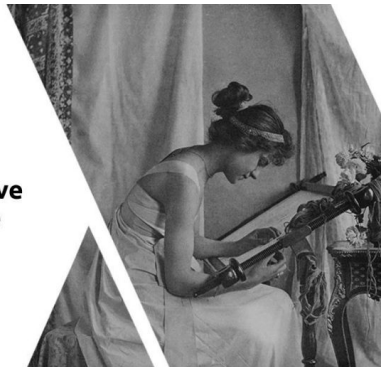
Image: Junge Dame mit Stickrahmen by Bismarck & Company, 1900, Museum of Arts and Crafts, Hamburg, Germany. CC0

Reframing culture: creative reuse of cultural heritage is an event organised by Europeana Foundation, the first of a webinar series exploring how creatives and cultural heritage institutions collaborate to bring audiovisual heritage into new media works. This event highlights how creatives working on Europeana's Online Creative Residency and Netherlands Institute for Sound and Vision (NISV) projects, have transformed archival and heritage material into new cultural stories, blending aesthetics, memory and critique. Participating creators and colleagues will share: