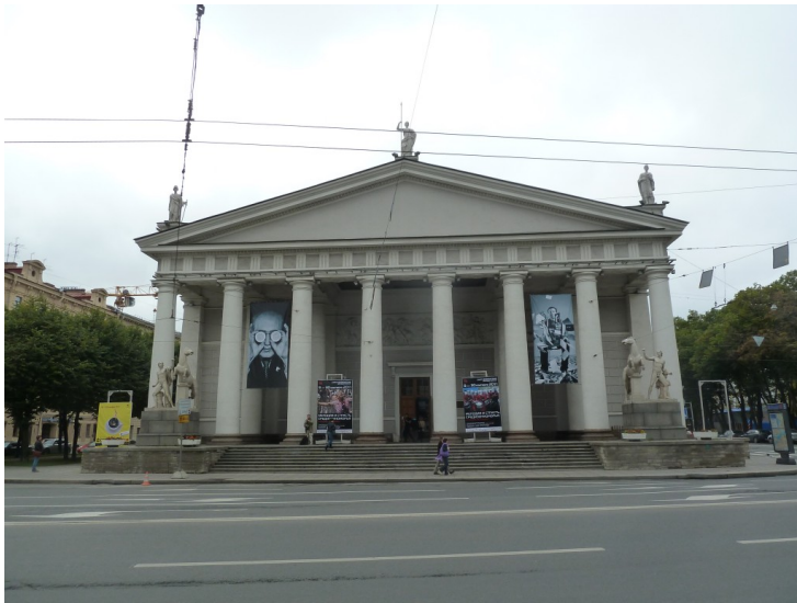
Photo Vernissage 2011, Saint Petersburg : «Melody and Passion of Mediterranean Italy, Spain»