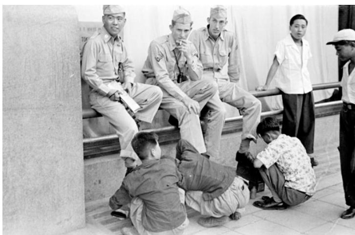
Title: Japan, American GI's getting their shoes shined in Tokyo; date of photograph ca. 1950s; Photographer: Forman, Harrison,

As we read in the presentation of the archive "There are no restrictions on access, except for one section called Peck School of the Arts Slide Collection. That collection is limited to UWM students, faculty, and staff". However in the copyright section it is clearly stated that "over 140,000 digital materials drawn from the collections of the Archives, Special Collections, the Curriculum Collection, Music Library, and the American Geographical Society Library. We make these materials available in order to facilitate their use for non-commercial and educational purposes, and to advance the mission of the Libraries and the University of Wisconsin-Milwaukee".