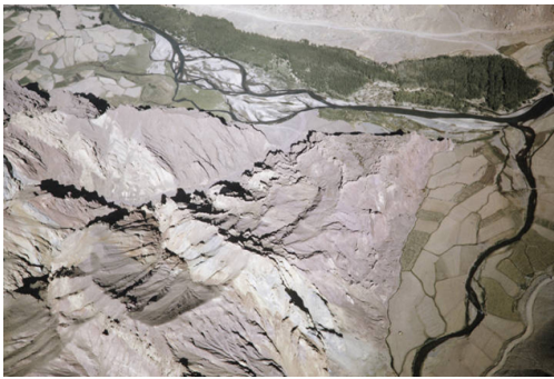
Afghanistan, aerial view of Bamiyan Valley; date of photograph ca. 1969

Among the project information we can read that ?Materials for approved projects are carefully selected by collection curators and subject specialists in the libraries and departments housing the source collections. UWM Libraries Department of Digital Collections and Initiatives is responsible for digitizing the selected materials according to established digitization standards and best practices. CONTENTdm digital media management software is used to build online collections. We retain digital master files in a separate storage infrastructure to ensure their integrity and accessibility in the future. High resolution digital images can be ordered using the online Order Images form.?