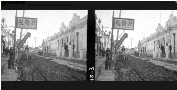
Acheng (China), muddy city street; date of photograph: between 1931 and 1932

to landscapes. Each photograph can be selected for further information: Title, Date of Photograph, Photographer's Note, Subject, Continent, General Region, State/Province, Type of Image and Original Item Medium, Digital Format, Original Collection, Provenance, Rights etc.