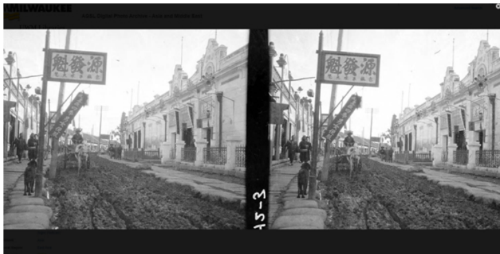
Acheng (China), muddy city street; date of photograph: between 1931 and 1932

to landscapes. Each photograph can be selected for further information: Title, Date of Photograph, Photographer's Note, Subject, Continent, General Region, State/Province, Type of Image and Original Item Medium, Digital Format, Original Collection, Provenance, Rights etc.