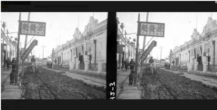
Acheng (China), muddy city street; date of photograph: between 1931 and 1932

to landscapes. Each photograph can be selected for further information: Title, Date of Photograph, Photographer's Note, Subject, Continent, General Region, State/Province, Type of Image and Original Item Medium, Digital Format, Original Collection, Provenance, Rights etc.