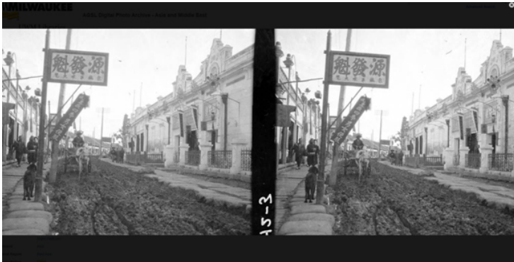
Acheng (China), muddy city street; date of photograph: between 1931 and 1932; Original collection: Robert L. Pendleton Collection

to landscapes. Each photograph can be selected for further information: Title, Date of Photograph, Photographer's Note, Subject, Continent, General Region, State/Province, Type of Image and Original Item Medium, Digital Format, Original Collection, Provenance, Rights etc.