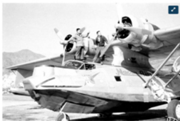
Photographer's Note: Macau: Gold runners; date of photograph: 1950

As we read in the presentation of the archive "There are no restrictions on access, except for one section called Peck School of the Arts Slide Collection. That collection is limited to UWM students, faculty, and staff". However in the copyright section it is clearly stated that "over 140,000 digital materials drawn from the collections of the Archives, Special Collections, the Curriculum Collection, Music Library, and the American Geographical Society Library. We make these materials available in order to facilitate their use for non-commercial and educational purposes, and to advance the mission of the Libraries and the University of Wisconsin-Milwaukee".