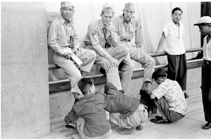
Title: Japan, American GI's getting their shoes shined in Tokyo; date of photograph ca. 1950s; Photographer: Forman, Harrison,

As we read in the presentation of the archive "There are no restrictions on access, except for one section called Peck School of the Arts Slide Collection. That collection is limited to UWM students, faculty, and staff". However in the copyright section it is clearly stated that "over 140,000 digital materials drawn from the collections of the Archives, Special Collections, the Curriculum Collection, Music Library, and the American Geographical Society Library. We make these materials available in order to facilitate their use for non-commercial and educational purposes, and to advance the mission of the Libraries and the University of Wisconsin-Milwaukee".