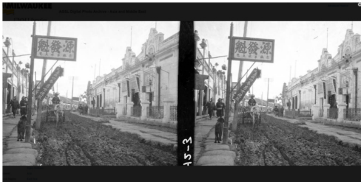
Acheng (China), muddy city street; date of photograph: between 1931 and 1932

to landscapes. Each photograph can be selected for further information: Title, Date of Photograph, Photographer's Note, Subject, Continent, General Region, State/Province, Type of Image and Original Item Medium, Digital Format, Original Collection, Provenance, Rights etc.