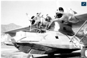
Photographer's Note: Macau: Gold runners; date of photograph: 1950

As we read in the presentation of the archive "There are no restrictions on access, except for one section called Peck School of the Arts Slide Collection. That collection is limited to UWM students, faculty, and staff". However in the copyright section it is clearly stated that "over 140,000 digital materials drawn from the collections of the Archives, Special Collections, the Curriculum Collection, Music Library, and the American Geographical Society Library. We make these materials available in order to facilitate their use for non-commercial and educational purposes, and to advance the mission of the Libraries and the University of Wisconsin-Milwaukee".