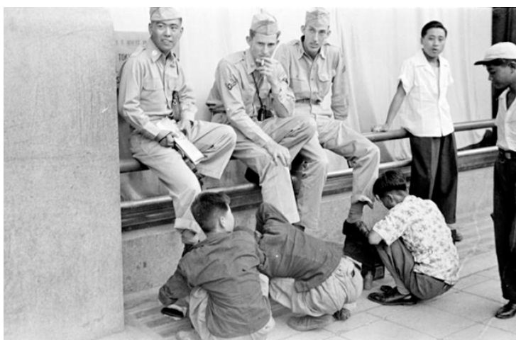
Title: Japan, American GI's getting their shoes shined in Tokyo; date of photograph ca. 1950s; Photographer: Forman, Harrison,

As we read in the presentation of the archive "There are no restrictions on access, except for one section called Peck School of the Arts Slide Collection. That collection is limited to UWM students, faculty, and staff". However in the copyright section it is clearly stated that "over 140,000 digital materials drawn from the collections of the Archives, Special Collections, the Curriculum Collection, Music Library, and the American Geographical Society Library. We make these materials available in order to facilitate their use for non-commercial and educational purposes, and to advance the mission of the Libraries and the University of Wisconsin-Milwaukee".