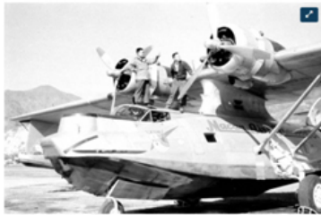
Photographer's Note: Macau: Gold runners; date of photograph: 1950

As we read in the presentation of the archive "There are no restrictions on access, except for one section called Peck School of the Arts Slide Collection. That collection is limited to UWM students, faculty, and staff". However in the copyright section it is clearly stated that "over 140,000 digital materials drawn from the collections of the Archives, Special Collections, the Curriculum Collection, Music Library, and the American Geographical Society Library. We make these materials available in order to facilitate their use for non-commercial and educational purposes, and to advance the mission of the Libraries and the University of Wisconsin-Milwaukee".