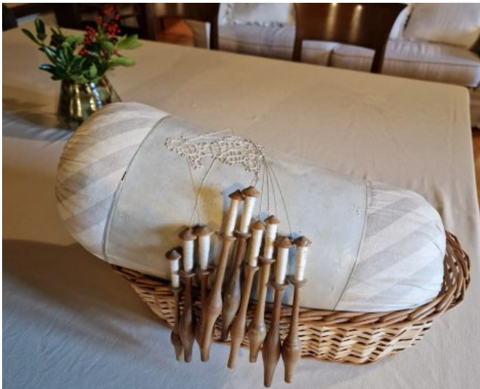
Laces from Idrija