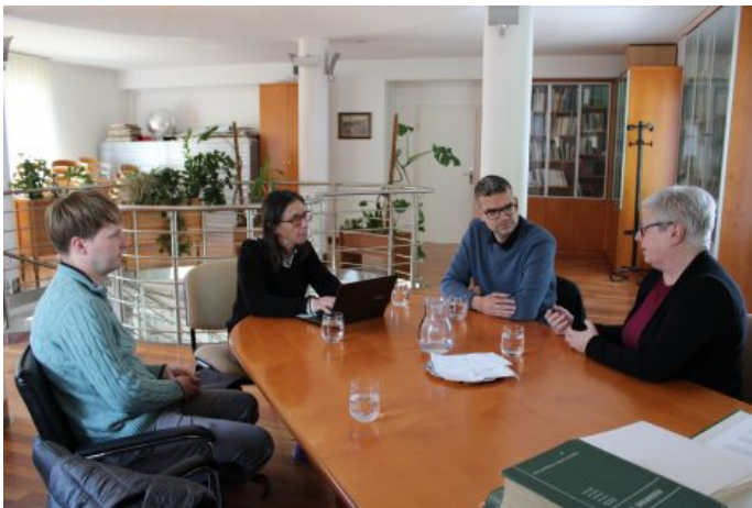
Meeting with the Director of the Mercury Heritage Management

Here below we provide a selection of the pictures taken during the encounters.