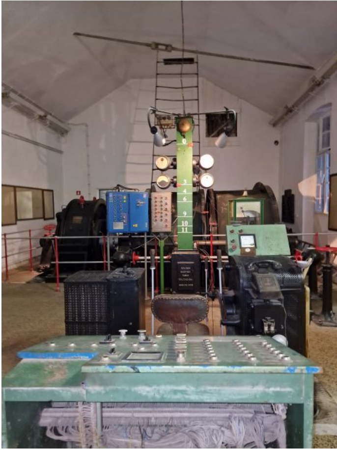
The elevators of one of the mercury mine shaft