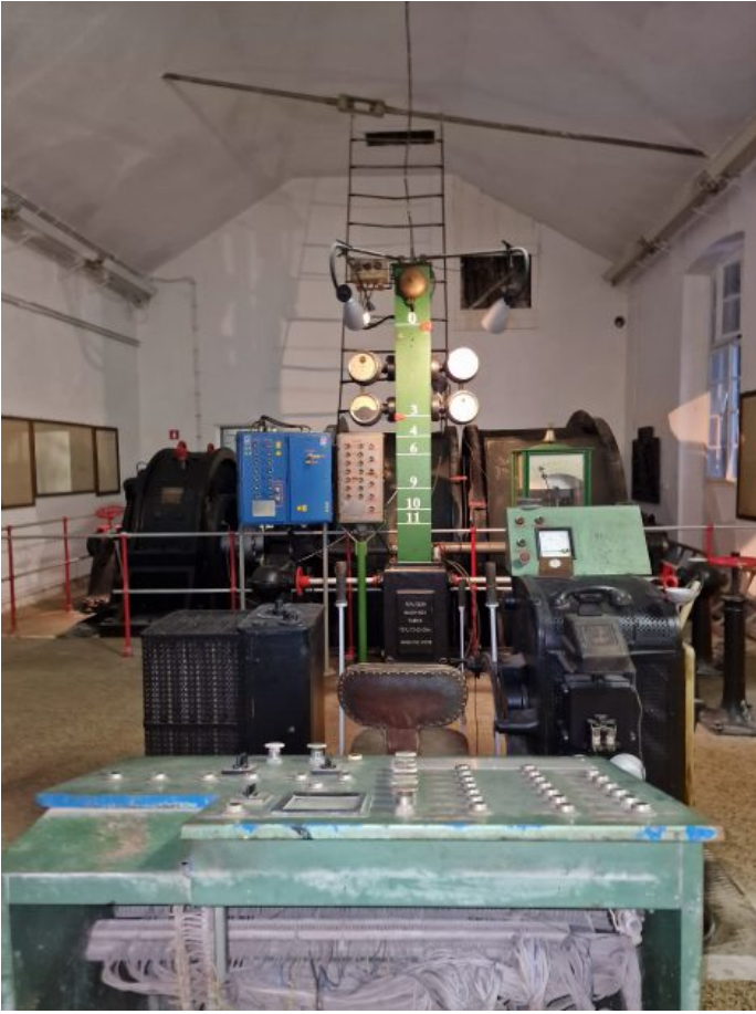
The elevators of one of the mercury mine shaft