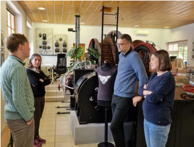
Meeting at the premises of ID20