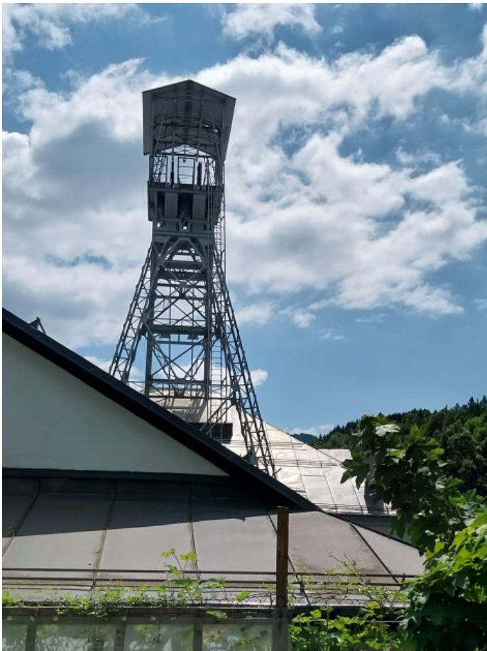
Mercury mine shaft