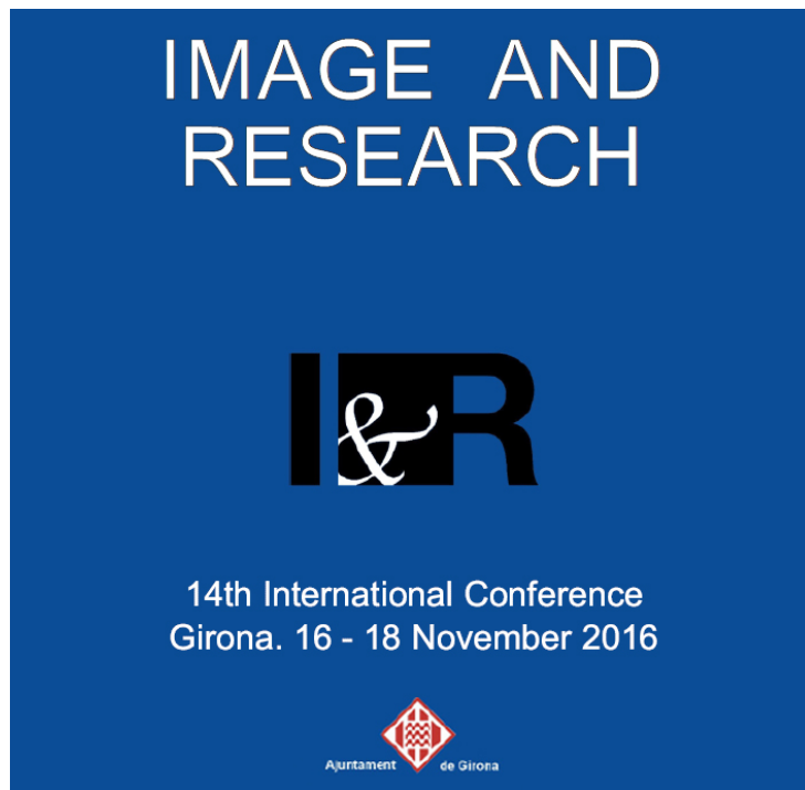
IMAGE AND RESEARCH 14th International Conference

The Centre for Image Research and Diffusion (CRDI) of the Girona City Council and the Association of Archivists of Catalonia, with the support of the Department of Culture of the Generalitat of Catalonia ? Sub-Directorate General of Archives, and the Spanish Ministry of Culture ? Sub Directorate-General of State Archives, the promotion of the International Council on Archives (CIA/ICA) and the collaboration of Digital Meets Culture, Michael Culture Association, Photographic Studies Institute of Catalonia (IEFC), Sindicat de la Imatge UPIFC and ANABAD, are calling the 14th Image and Research International Conference , which will be held in the Palau de Congressos de Girona from 17th to 18th of November.