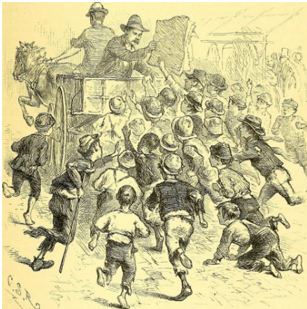
Image from page 496 of "The boy travellers in Australasia ..." (1889)

The project aims to make available up to 14.6 million images on Flickr, all extracted from books, magazines and newspapers published over a 500 year period and digitized by the Internet Archive organization. Currently, the collection uploaded in Flickr comprises about 2.6 million public domain images, extracted and catalogued after the digitization processes.