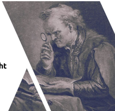
Image: Men beslist over een kaart met een vergrootglas, 1777.

Copyright and policy office hours are informal online sessions that seek to bring cultural heritage professionals together in discussing and addressing common challenges. On September 16th, 15-16:00 CET, professionals will talk about various examples of cultural heritage organisations measuring risk, and some tools available.