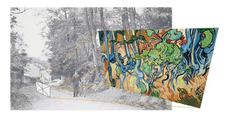
Diagram showing Van Gogh's possible position in relation to the hillside in Auvers-sur-Oise when painting ?Tree Roots' (1890), ©arthénon