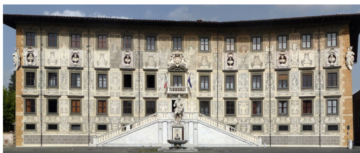
Pisa, Palazzo della Carovana, Scuola Normale SuperioreCC BY-SA 3.0

Authors are invited to submit abstracts for poster and paper presentations related to the Topics of Interest for the Cloud Forward 2015 Conference: From Distributed to Complete Computing . The 2015 edition will take place at the Scuola Normale Superiore in Pisa, Italy, from 6 to 8 October 2015 , in friendship with Internet Festival.