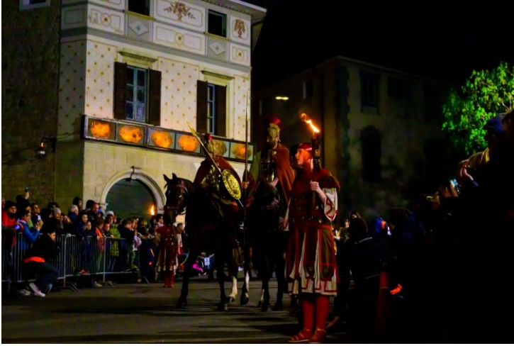
The Processions of Mendrisio

Read more: https://www.photoconsortium.net/beyond-borders-hackathon/