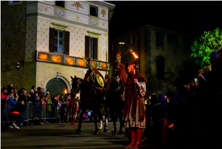
The Processions of Mendrisio

Read more: https://www.photoconsortium.net/beyond-borders-hackathon/