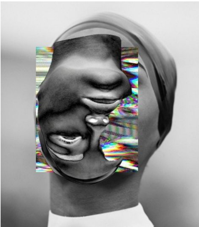
Nkiru Oparah, Precursor to a dream, 2014.

Jepchumba of Africandigitalart.com presents us the digital collage , in Africa a growing form of art that utilises technology to produce a range of artworks, incorporating digital video, animation, photography, animated gif's and digital photo manipulation.