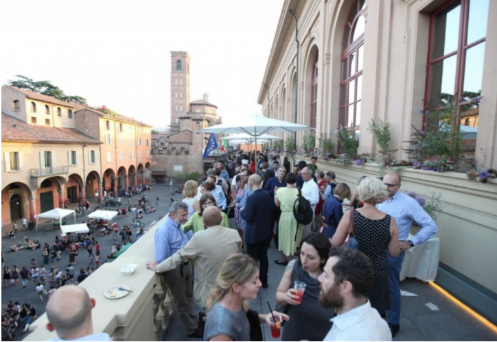
pic from the Bologna kick-off meeting

More information about ROCK: https://www.rockproject.eu/