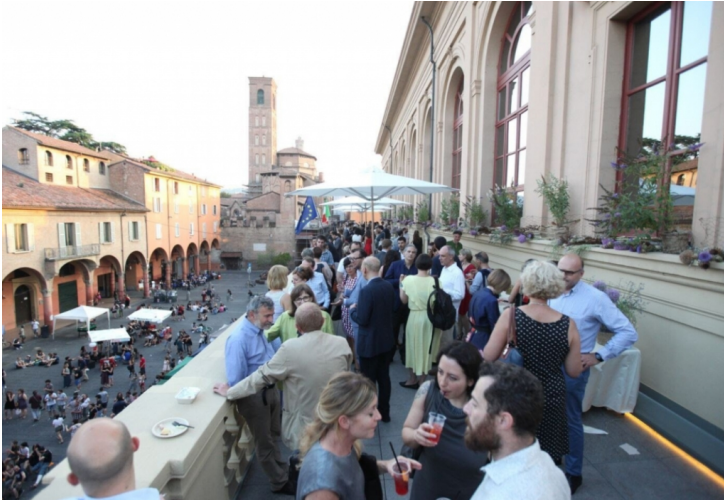
pic from the Bologna kick-off meeting

More information about ROCK: https://www.rockproject.eu/