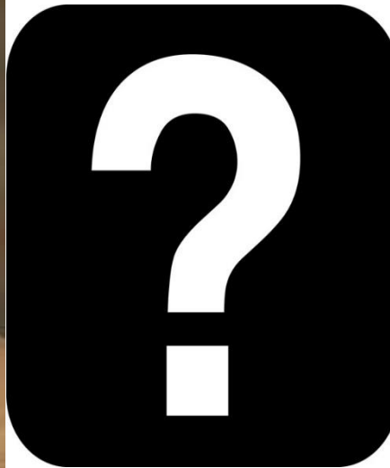
Rep. from NGV