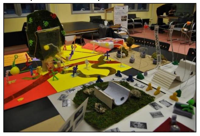
Figura 1: Co-creation works

These kind of projects have relevance both to us as they are relevant to our diverse publics and stakeholders such as post migrant citizens of the Netherlands, members of originating communities, often indigenous peoples, and to nation states and partner institutes across the globe. Because for CH managers such as museums and libraries, working with non-conventional stakeholders and partners offers inspiring and challenging possibilities for changing daily practice. It is because we do not "speak" the same professional or academic language and do not "use" the same analytical