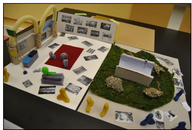
Figura 2: Co-creation ideas