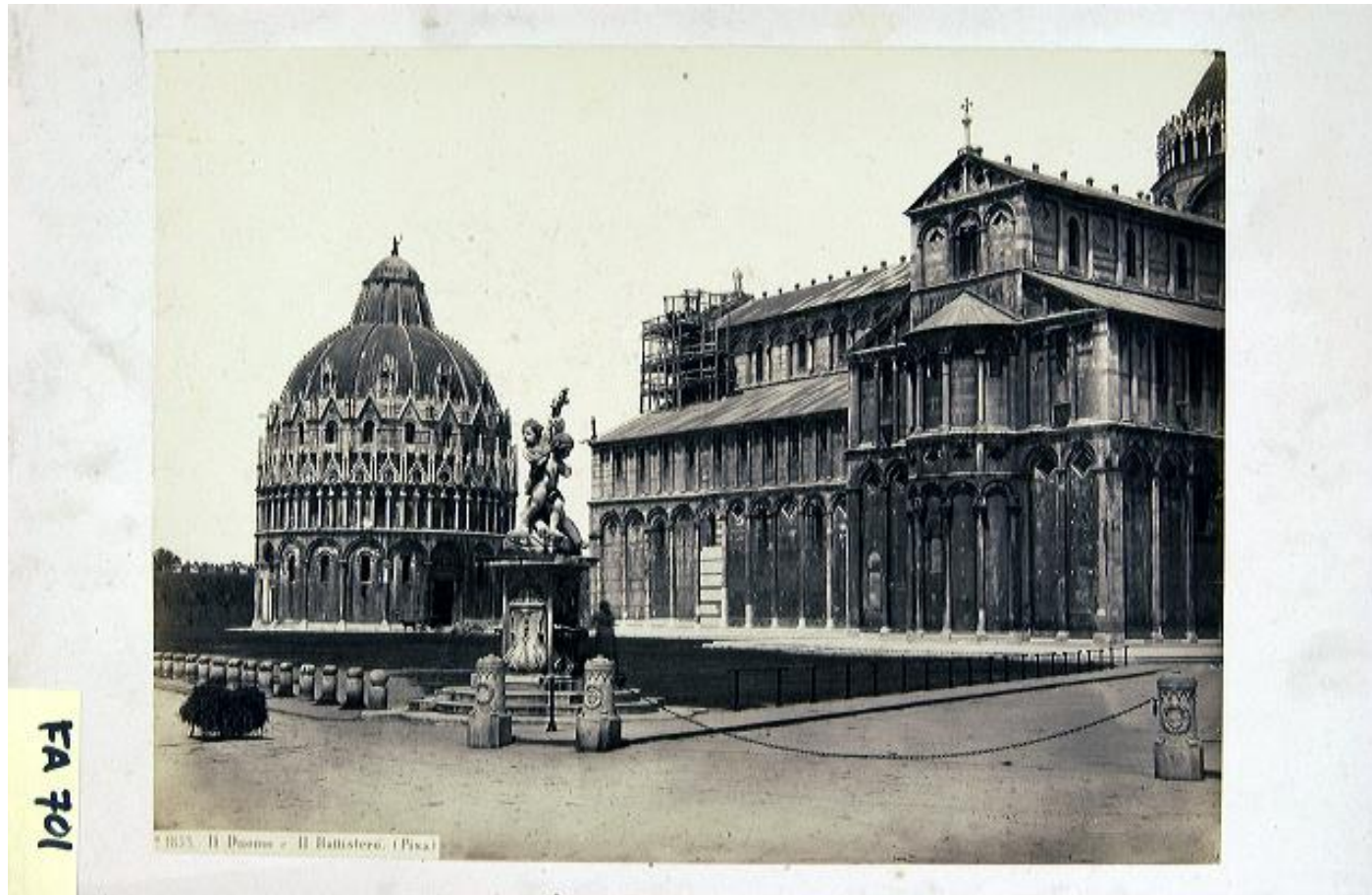
'Pisa', CC-BY Amsterdam Museum. Source: http://www.europeana.eu/portal/record/2021608/dispatcher_aspx_action_search_database_ChoiceCollect_search_preref_49621.html