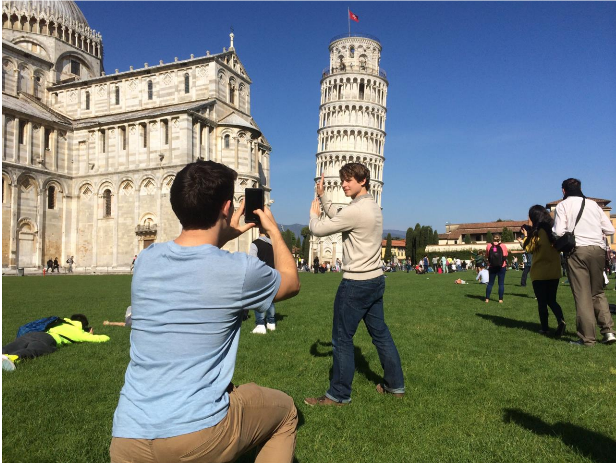
'My own tower of Pisa'