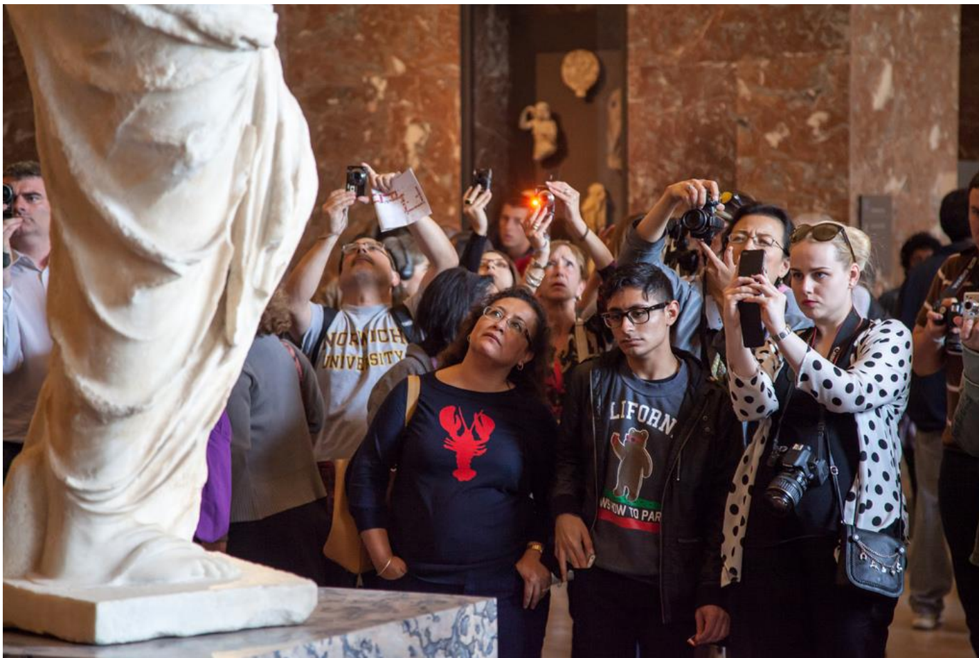
'People taking pictures'