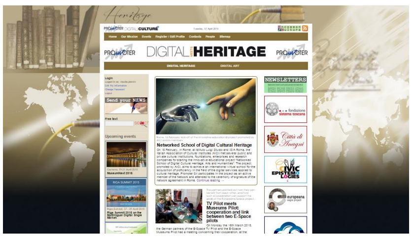
Fig. 2 The Digital Heritage section

The Digital Heritage section collects articles and information about projects and initiatives for the digitisation of cultural heritage and the access to the digital cultural heritages all over the world, as well as insights about the digitised content and the use of informatics and digital tools in museums and exhibitions.