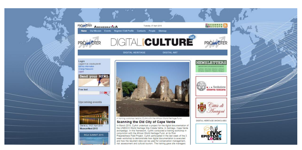
Fig. 1 Digitalmeetsculture.net homepage

Aim of the portal is to discover, analyse, promote and disseminate the new achievements in the field of digital culture and act as a landmark and as a valuable mean of information and communication for different users.