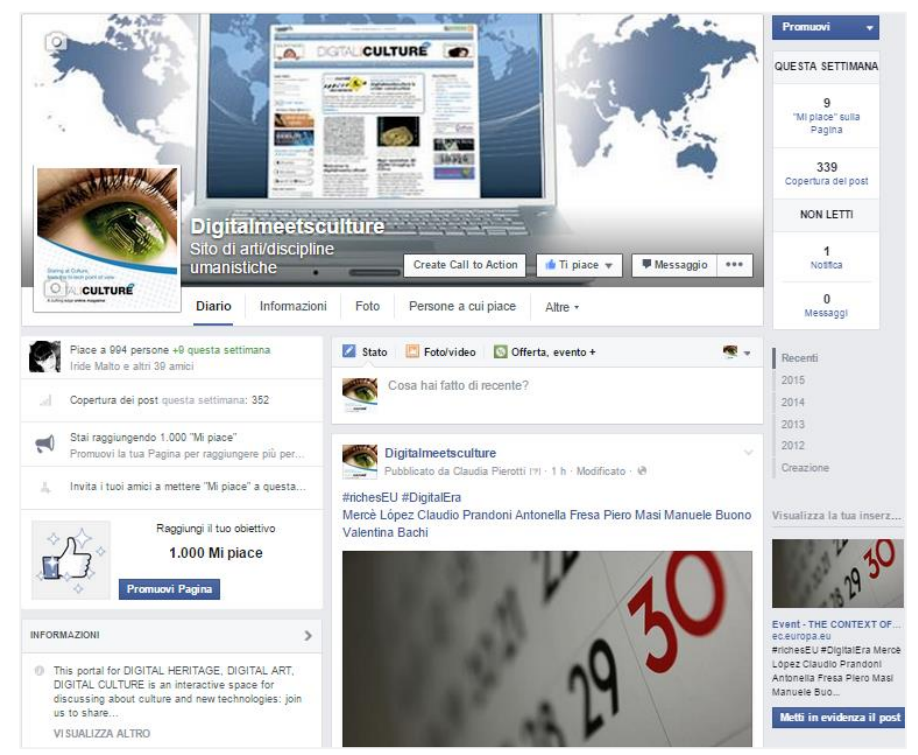
Fig. 7 Digital Meets Culture Facebook page