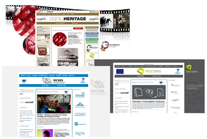
Fig. 4 Examples of showcases and blogs hosted by Digitalmeetsculture.net

Furthermore, the showcase provides easy access to other useful services, such as document repository, embedding of interactive questionnaires/interviews, online registration to conferences and events etc., thus acting as a powerful tool to raise awareness about the project, to increase the visibility to the project's results and to stimulate other institutions, organisations and projects to get in contact with it.