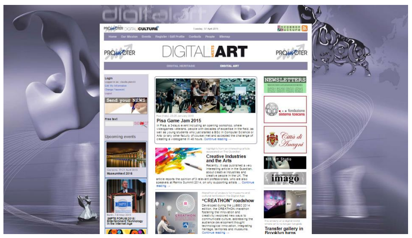
Fig. 3 The Digital Art section

The Digital Art section focuses on the latest, innovative forms of digital art in any expression and gives space and visibility to upcoming events and discussions about this large, open and evolving topic. This section contains articles related to the latest news pertaining to creative industry (movies, animation, games, etc..) and to creative uses of digital art in all its various expressions: computer generated digital art and digital manipulation of material taken from other sources (transdigital art), digital installations and interactive art, virtual environments, photography, music, experimental performance art etc.