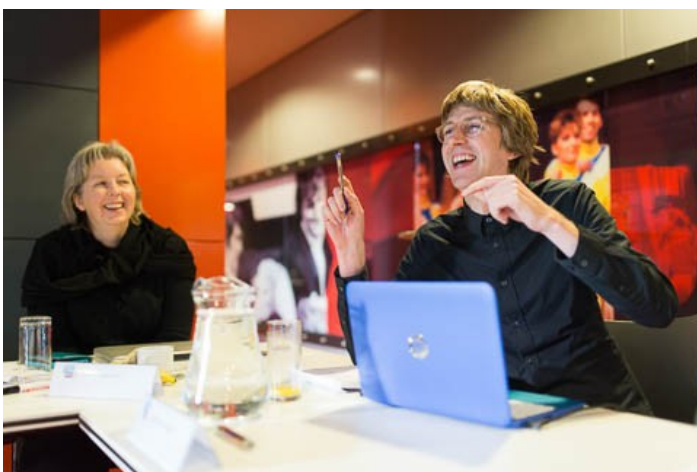
Participants at work.