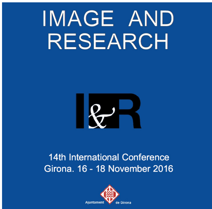
IMAGE AND RESEARCH 14th International Conference

The Centre for Image Research and Diffusion (CRDI) of the Girona City Council and the Association of Archivists of Catalonia, with the support of the Department of Culture of the Generalitat of Catalonia ? Sub-Directorate General of Archives, and the Spanish Ministry of Culture ? Sub Directorate-General of State Archives, the promotion of the International Council on Archives (CIA/ICA) and the collaboration of Digital Meets Culture, Michael Culture Association, Photographic Studies Institute of Catalonia (IEFC), Sindicat de la Imatge UPIFC and ANABAD, are calling the 14th Image and Research International Conference , which will be held in the Palau de Congressos de Girona from 17th to 18th of November.