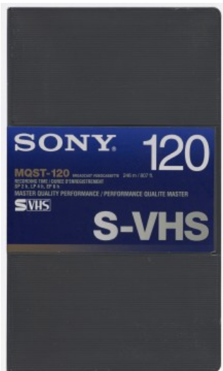
S-VHS tape box, one of formats likely to be reformatted.

In contrast, the report tells us, an encoding 'defines the way the picture and sound data is structured at the lowest level (i.e., will the data be RGB or YUV, what is the chroma subsampling?). The encoding also determines how much data will be captured: in abstract terms, what the sampling rate will be and how much information will be captured at each sample and in video-specific terms, what the frame rate will be and what will the bit depth be at each pixel or macropixel.' The report compares the following encodings: Uncompressed 4:2:2 , JPEG 2000 lossless , ffv1 , and MPEG-2 encoding .