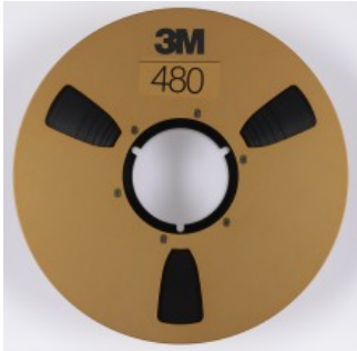
1-inch open reel tape.

Out of all of the comparisons, is there a single winning format? The team said no. Practices and technology for video reformatting are still emergent, and there are many schools of thought. Beyond the variation in practice, an archive's choice may also depend on the types of video they wish to reformat. The narrative section of the report indicates that certain classes of items—say, VHS tapes that contain video oral history footage—can be successfully reproduced in a number of the formats that were compared. In contrast, a tape of a finished television program that contains multiple timecodes, closed captioning, and four audio tracks will only be reproduced with full success in one or two of the formats being compared.